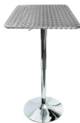
Stainless Steel Bistro Table

30" w x 18" h 30" w x 30" h 30" w x 42" h