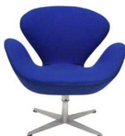
Blue Swan Chair