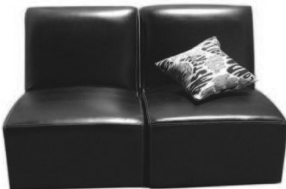
Armless Loveseat (2 Armless Chairs)