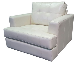
Contemporary Ivory Chair