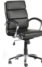
Elite Executive Chair