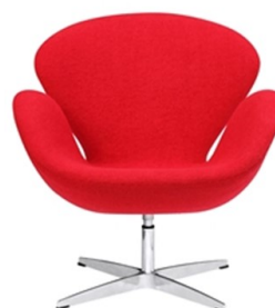
Red Swan Chair