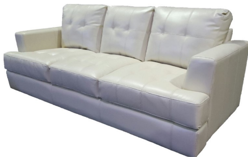
Contemporary Ivory Sofa