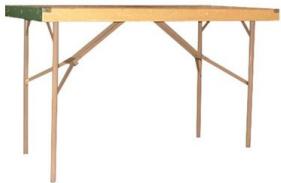
Plain Tables 4', 6', & 8' lengths available