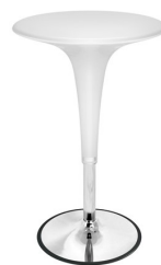
White Gelato Table