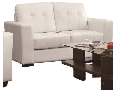
Contemporary White Love Seat