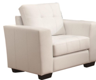
Contemporary White Chair