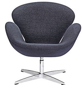
Grey Swan Chair