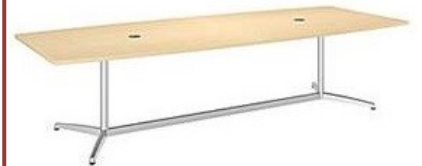
Maple Conference Table