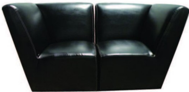
Loveseat (2 Corner Chairs)