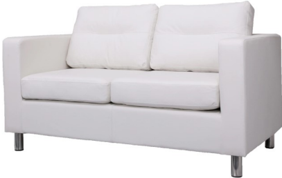
Detroit Love Seat