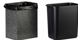
Wastebasket (Disposable or plastic)