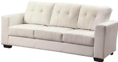
Contemporary White Sofa