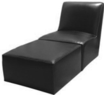
Armless Lounger (Armless Chair & Ottoman)