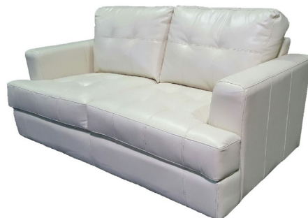
Contemporary Ivory Love Seat